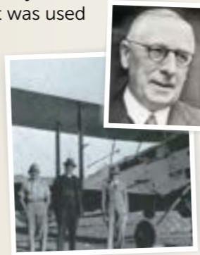
Reverend John Flynn's dream of the Flying Doctor was achieved thanks to a Gift in Will, which allowed him to lease his first aircraft.

Today, we're hoping you too will make a gift in your Will, so we can go further for generations to come.